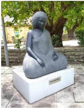
Peace Sculpture in Peace Park, Katoomba