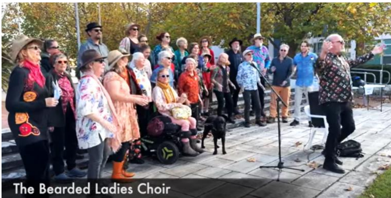
The Bearded Ladies Choir

The Bearded Ladies Choir at the Anzac Day Reflection, Peace Park in Katoomba, 25 April 2025