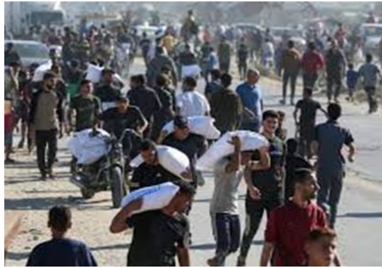
Desperate Palestinians at an Israeli/US run food distribution 'death trap' in Gaza.